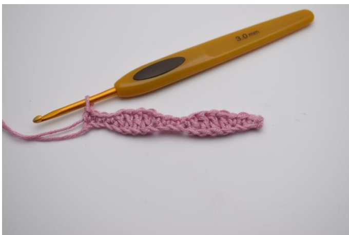
5. Work *1sc in the next 4 sts, 1 dc in the following 4 sts* repeat *-* to the end of the row, and end with 1 sc in the last 4 sts.