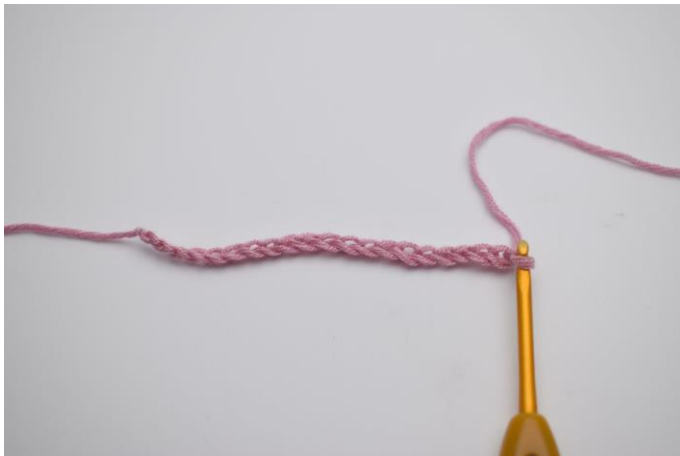
1. Start with a chain.