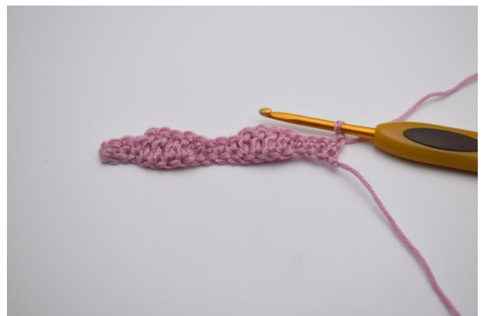
6. Ch 1 and turn.