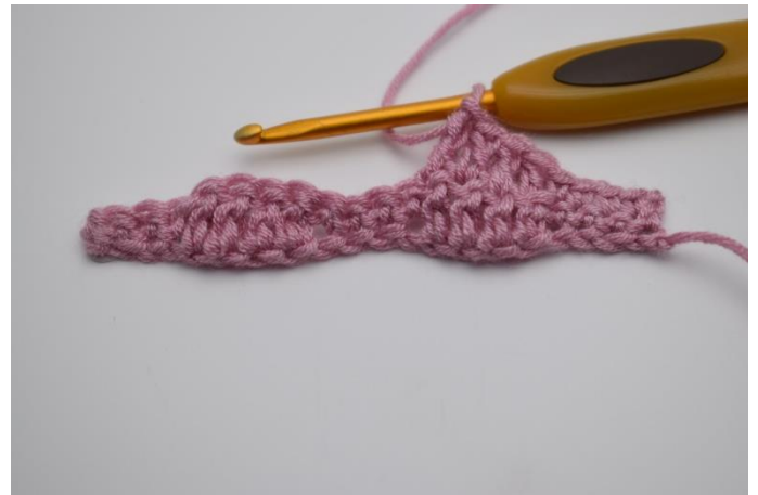
8. Work 1 dc in the next 4 sts.