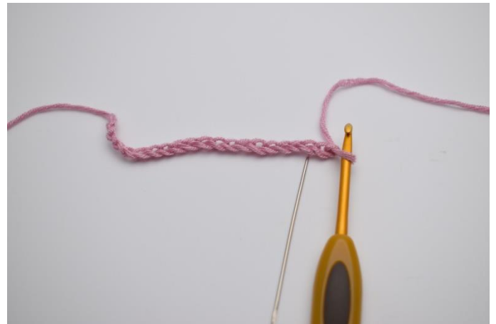
2. Skip the first 2 ch sts, so you are working in the 3 rd ch from the hook.