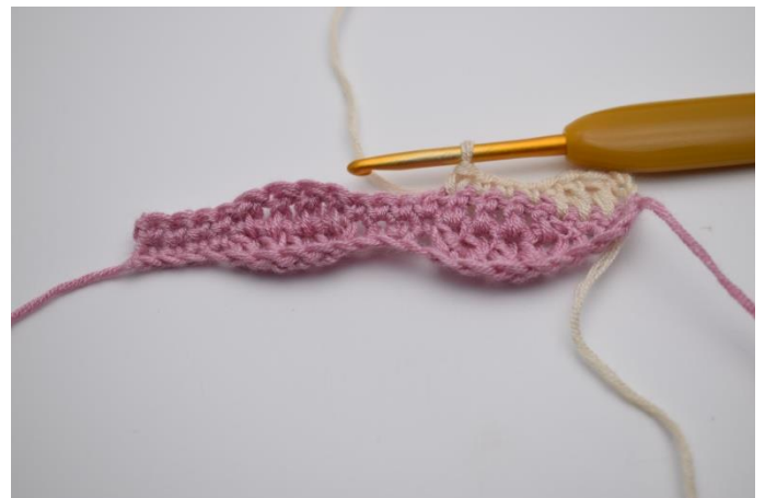
12. Work 1 sc in the following 4 sts.