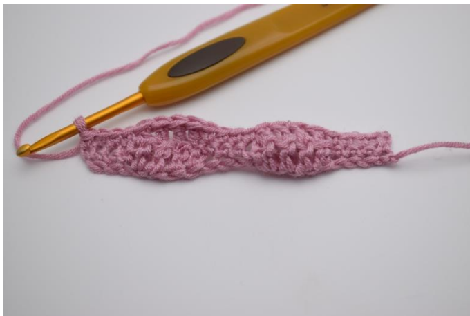
9. Work *1sc in the next 4 sts, 1 dc in the following 4 sts* repeat *-* to the end of the row, and end with 1 sc in the last 4 sts.