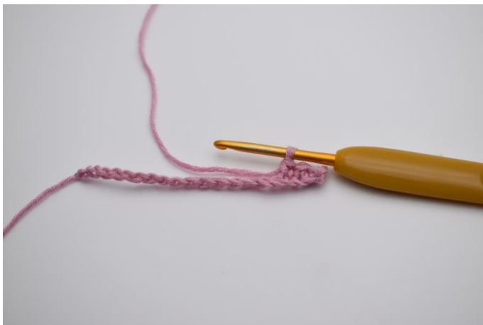
3. Work 1 sc in the next 3 ch sts.