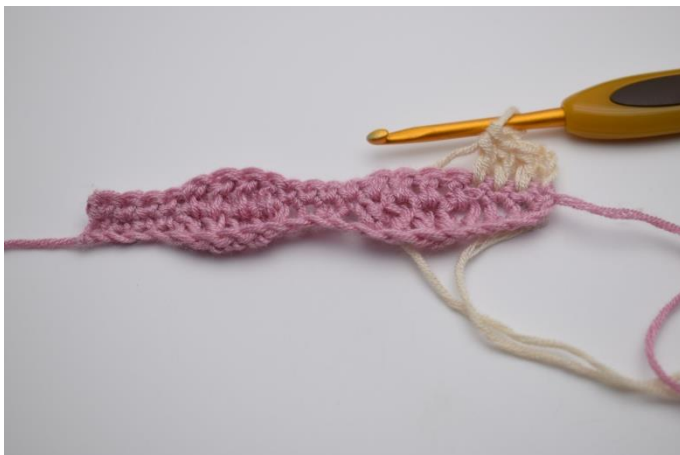
11. Work 1 dc in the next 3 sts.