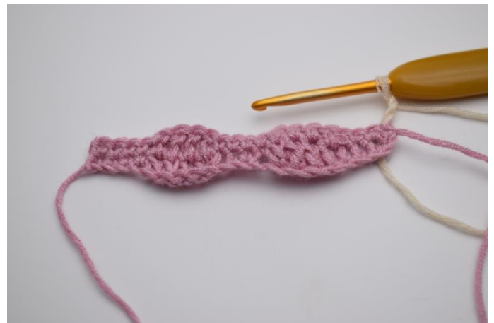
10. Change to color 2. Ch 3. This counts as 1 dc.