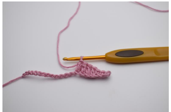
4. Work 1 dc in the next 4 sts.