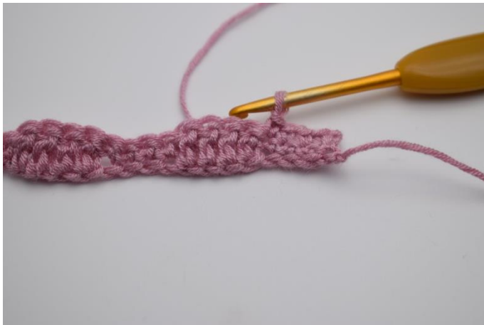
7. Work 1 sc in the next 4 sts.