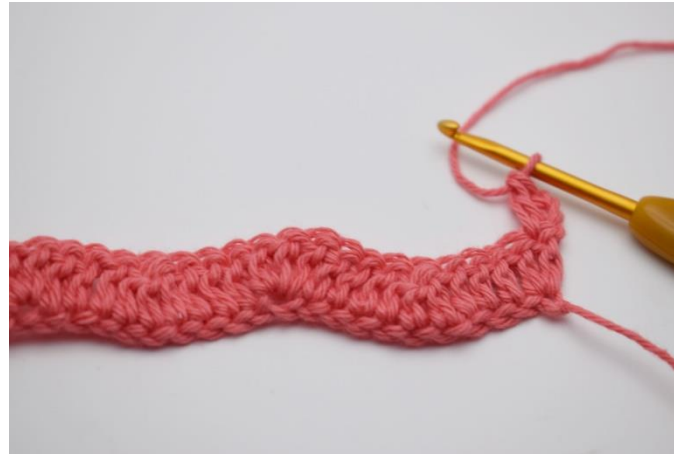
10. Dc 1 in first st.