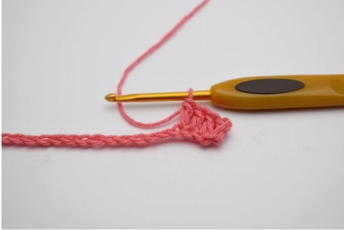
3. Dc 1 in the next 3 ch.