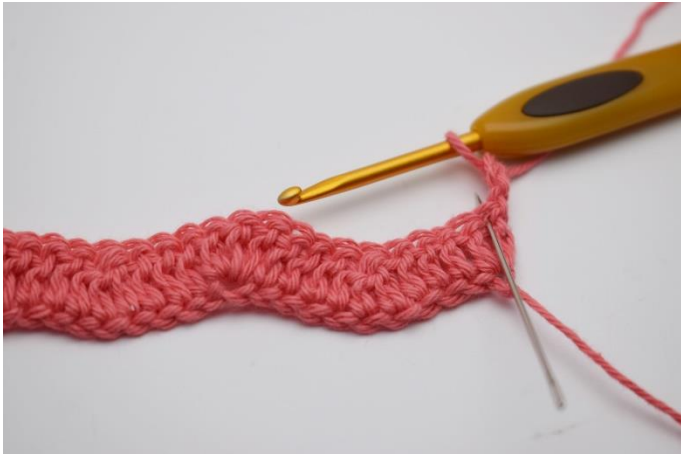
9. Turn by ch 3. The first dc is worked in the first st, here marked with the needle.