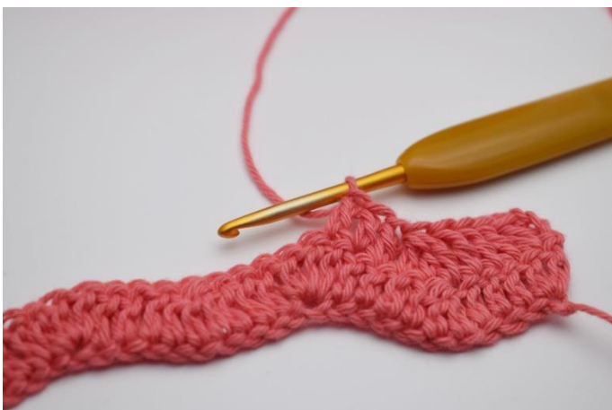
13. Dc 1 in the next 3 sts.