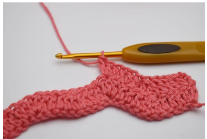
14. Dc 3 in the following (same) st.