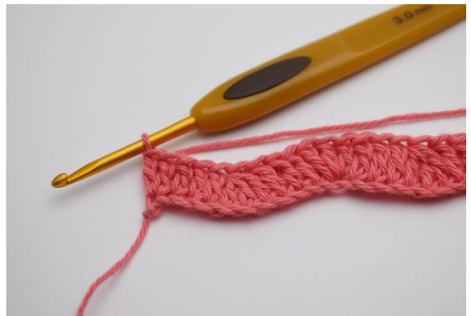
8. Dc 1 in the next 3 ch. Dc 2 in the last ch.