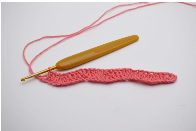
7. "Dc 1 in the next 3 ch. Dc 3 tog. Dc 1 in the next 3 ch, and dc 3 in the following (same) ch". Repeat "to" across until you have 4 ch left.