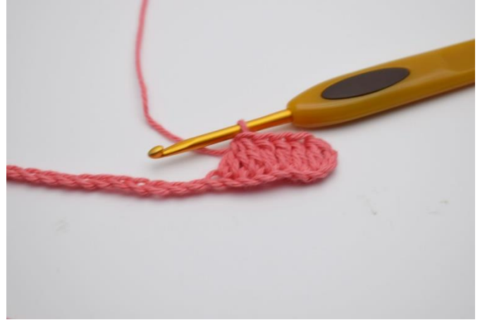
4. Dc 3 tog.