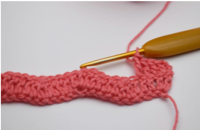
11. Dc 1 in the next 3 sts.