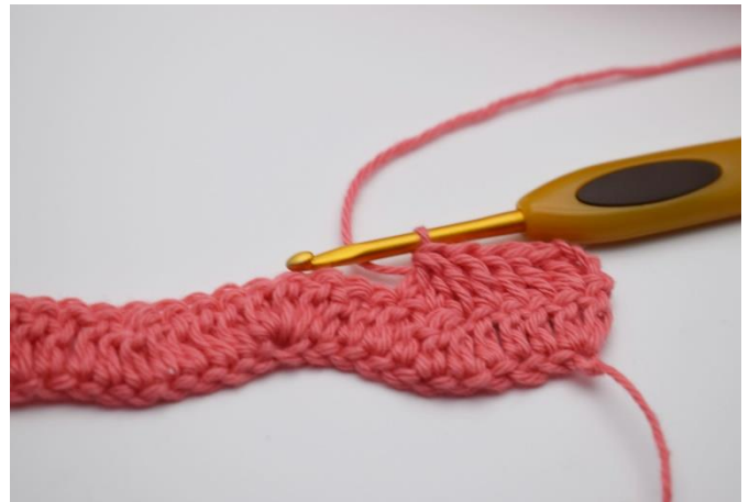
12. Dc 3 tog.