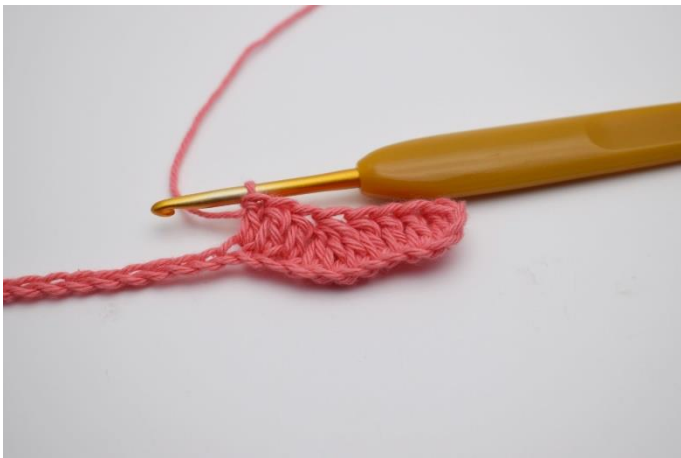
5. Dc 1 in the next 3 ch.