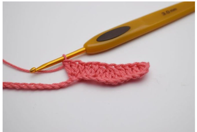
6. Dc 3 in the following (same) ch.