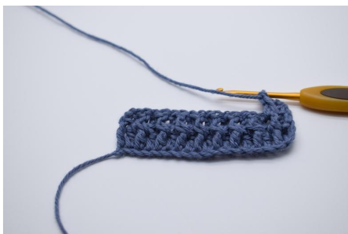
11. And 1 fpdc around the next post of the previous row.