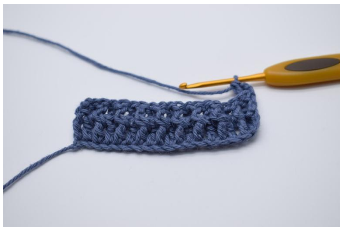
10. Now, work 1 bpdC around the post of the previous row.