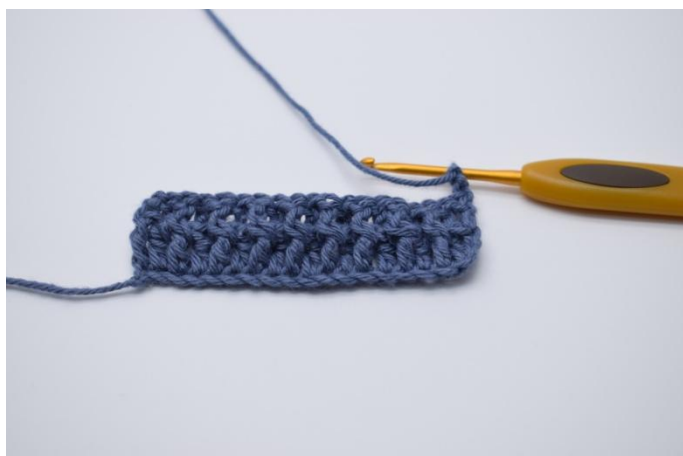
9. Turn your work by chaining 2. They replace the first regular dc