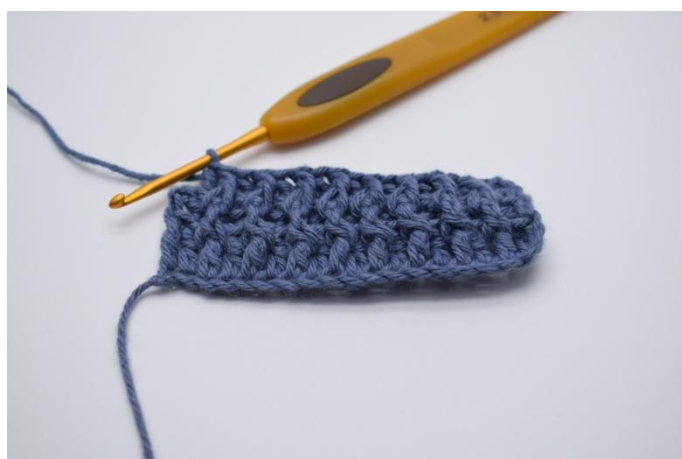
12. Repeat alternating between 1 bpdC and 1 fpdc until the end of the row.