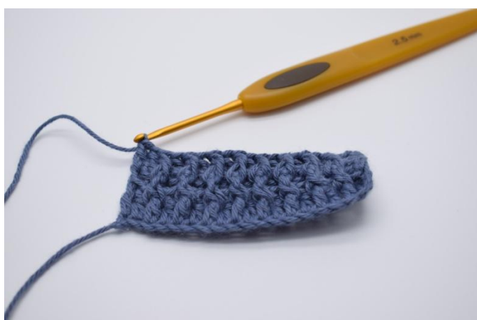
13.. In the turning s, work 1 regular dc. Repeat the rows like this until you have the desired cloth size.