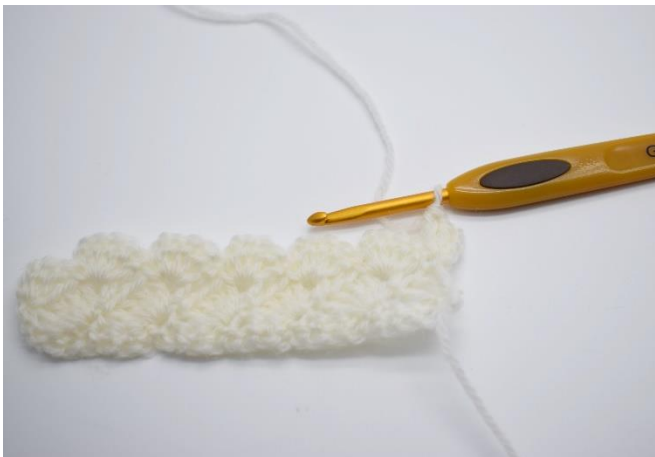
3. Work 2 dc in the st.