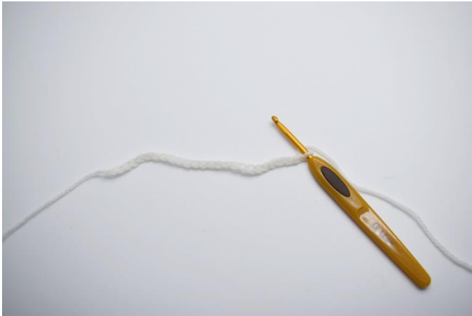
1. Cast on your ch.