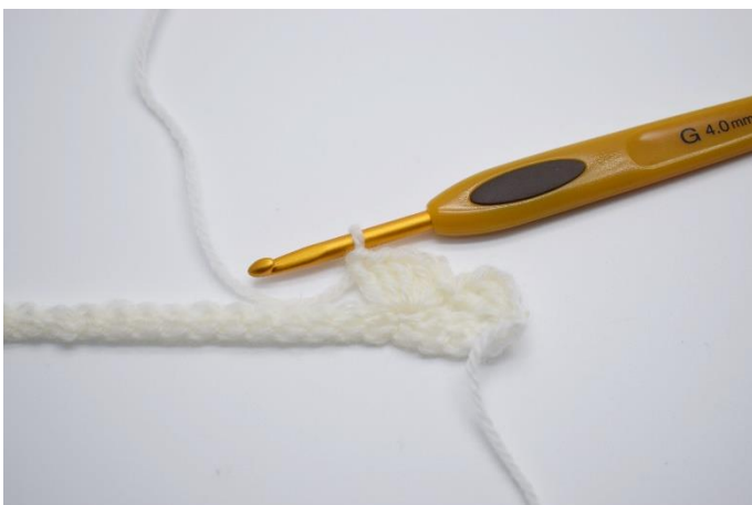
5. In next st work "1 sc, 2 ch, 4 dc".