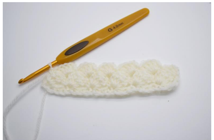
18. This is how the work looks now. Repeat this row until you have reached the desired measurement.