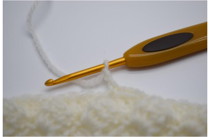
4. Make 2 ch.