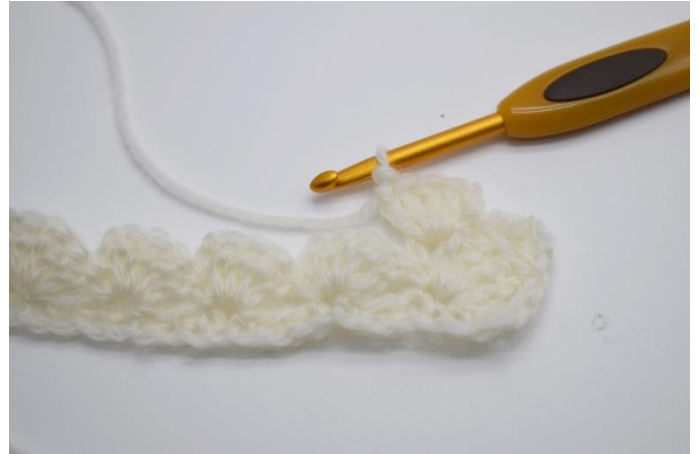
14. "1 sc, 2 ch, 4 dc".