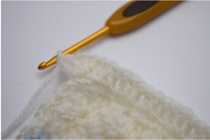
15. In the ch space in the corner, work "2 dc, 1 ch, 2 dc". Now repeat all the way around the blanket.