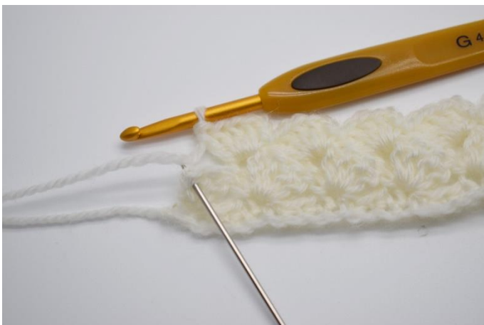
17. In the last st, work 1 sc.