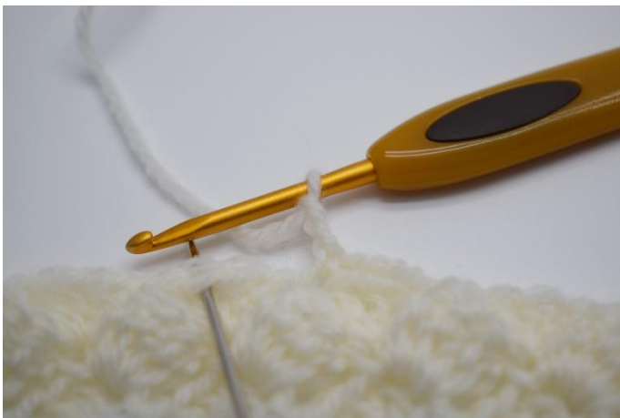
5. Skip 2-3 sts.