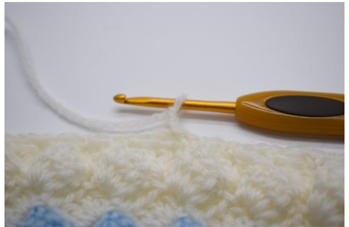
12. Now make 2 ch in the first ch space you've just made around the border.