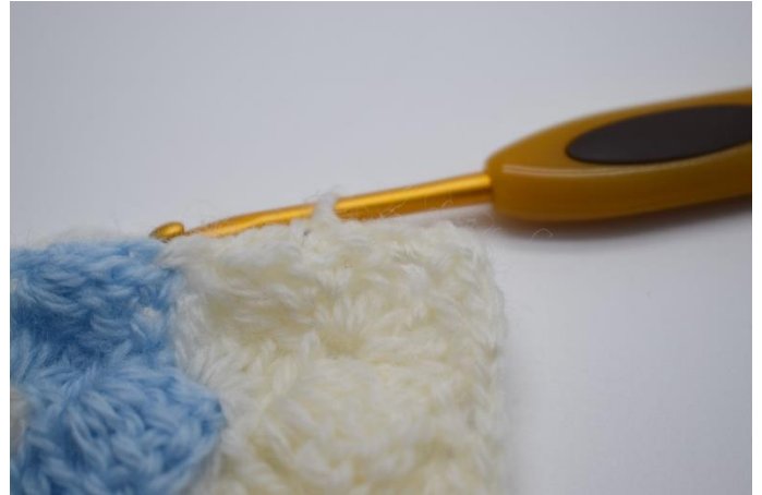
10. On the sides of the blanket, don't skip 2-3 sts, but repeat "1 sc, 2 ch, 1 sc" for each row approx. Beware not to make it too tight or it will curl.