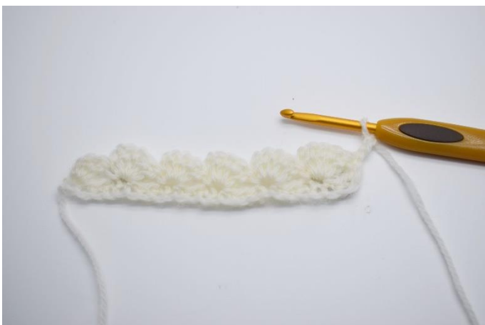
11. Turn the work using 3 ch.