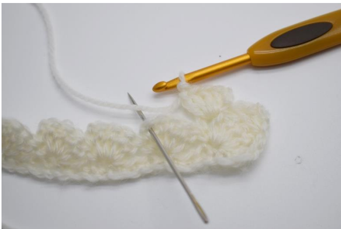
15. In the next ch space from the previous row, repeat and work "1 sc, 2 ch, 4 dc".