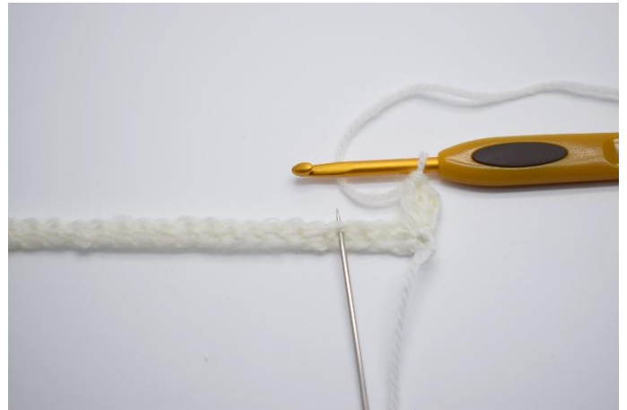
4. Skip 3 sts.