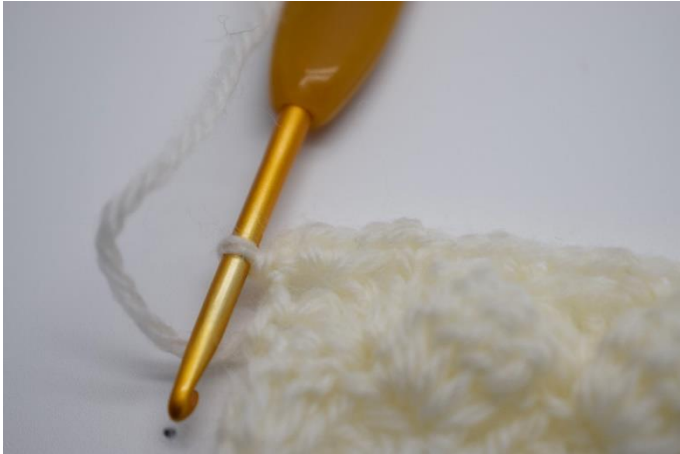
9. Like this.