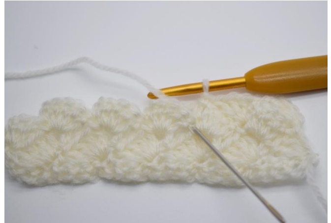
8. Now work in sc from the previous row.