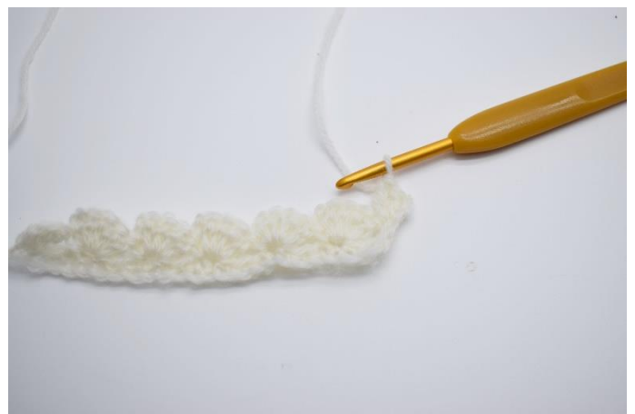
12. Work 2 dc in 1st st.