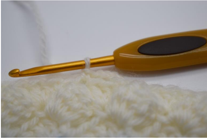
3. Make 1 sc in next st.