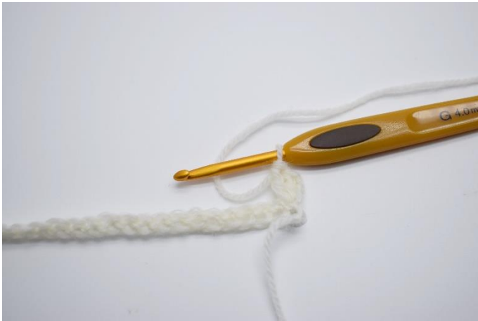
3. Turn the work using 3 ch, and now work 2 dc in 1st sc.