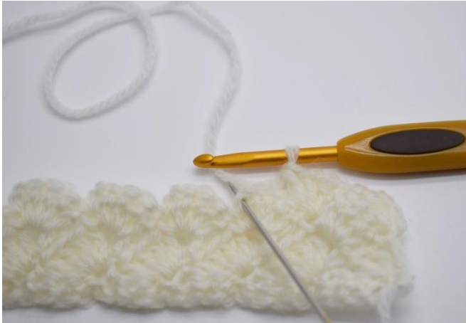
7. Work 1 sc in the ch space from the previous row.