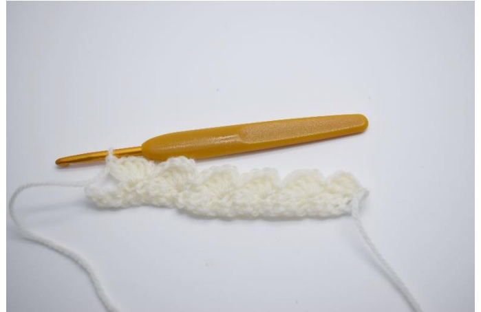
8. Repeat "skip 3 sts, in next st work "1 sc, 2 ch, 4 dc"." across.