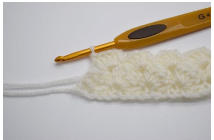
16. Repeat across.