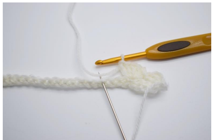
5. Skip 3 sts.