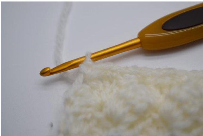
7. Repeat "2 ch, skip 2-3 sts, 1 sc" on all sides.