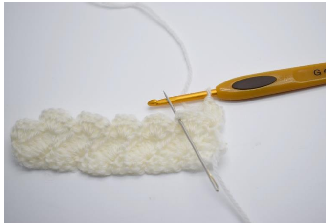
4. Now work 1 sc in the ch space from the previous row.