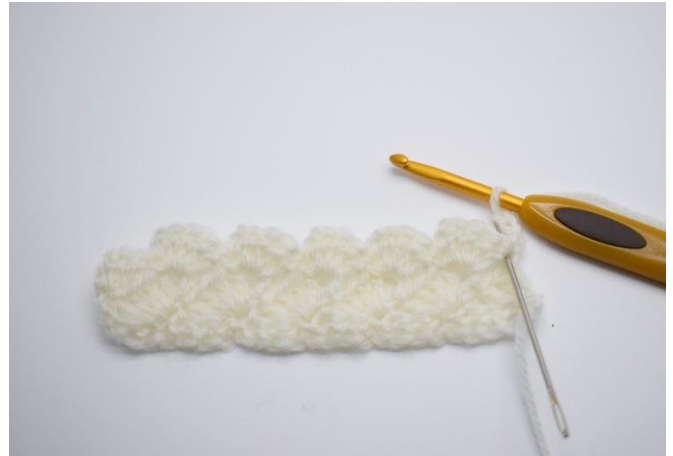
2. The next sts are worked in 4th ch from the hook.