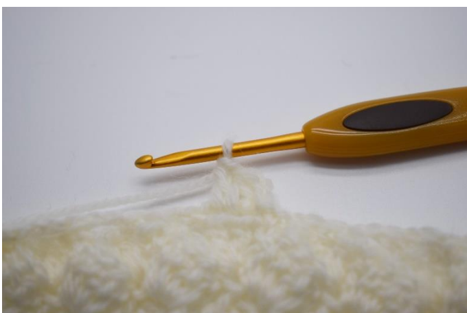
13. Work 2 dc in the same ch space.