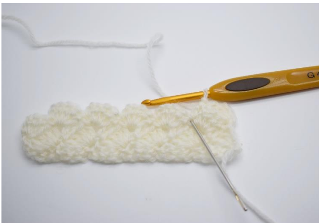
5. Now work in the sc from the previous row.