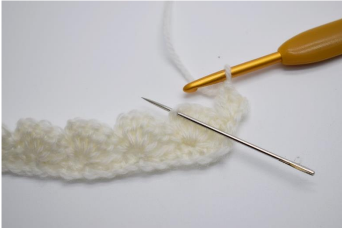
13. In the ch space from the previous row work