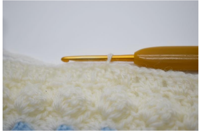
16. Finish with 1 sl st.