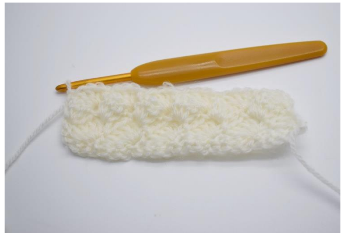
10. Repeat across and finish with 1 sc.