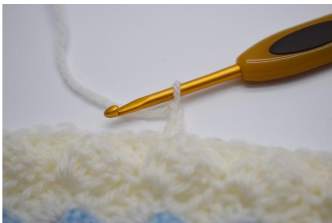
1. Start the border with color 1 at the top or the bottom. Make 2 ch.

The border is worked using a hook no. C/2-D/3 and color 1.