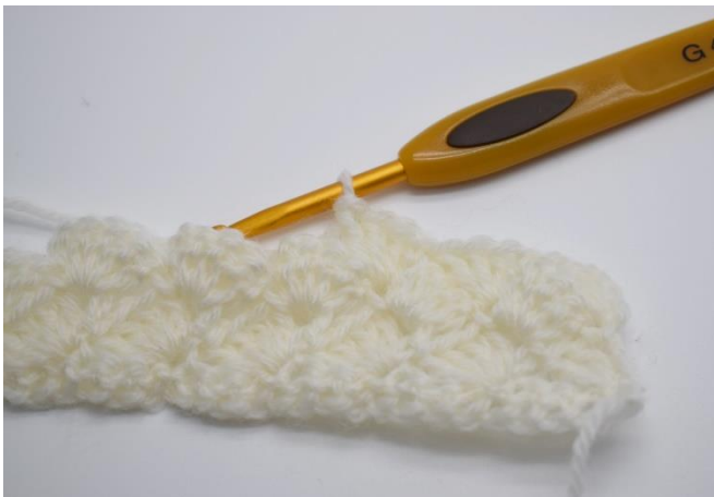
9. Work 3 dc in sc from the previous row.