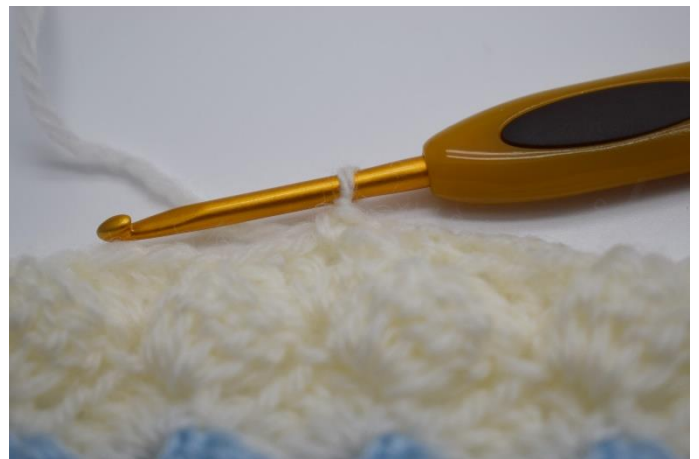
6. Work 1 sc in next st.