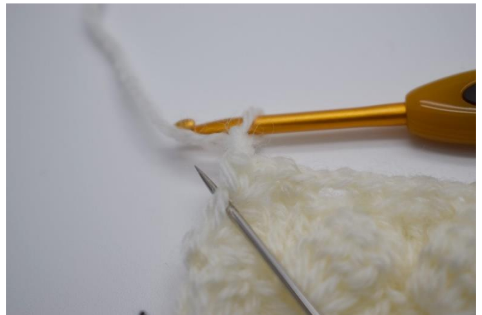
8. In the corner st, work 2 ch and 1 sc in the same st.