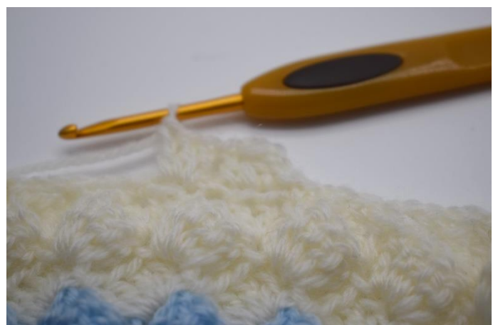
14. Work 3 dc in the next ch space.