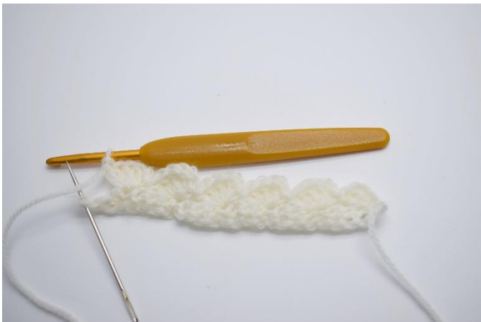
9. In last st work 1 sc.