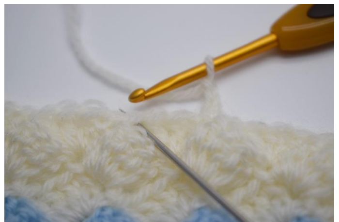
2. Skip 2-3 sts