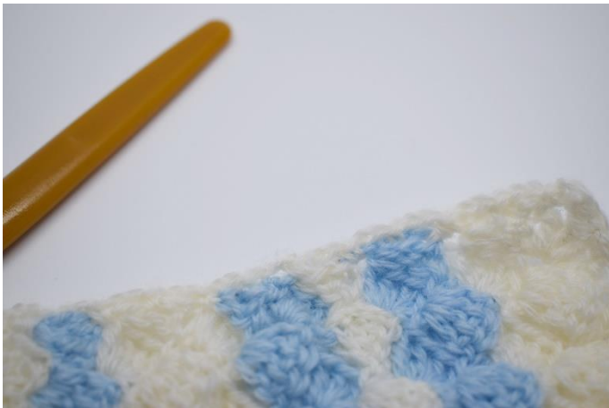
11. Repeat all the way around the blanket. Finish with 1 sl st.