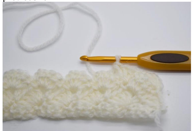
6. Work 3 dc in sc from the previous row.