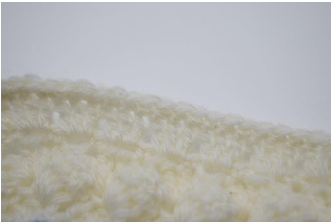
17. Now finish the border with one round of sc.