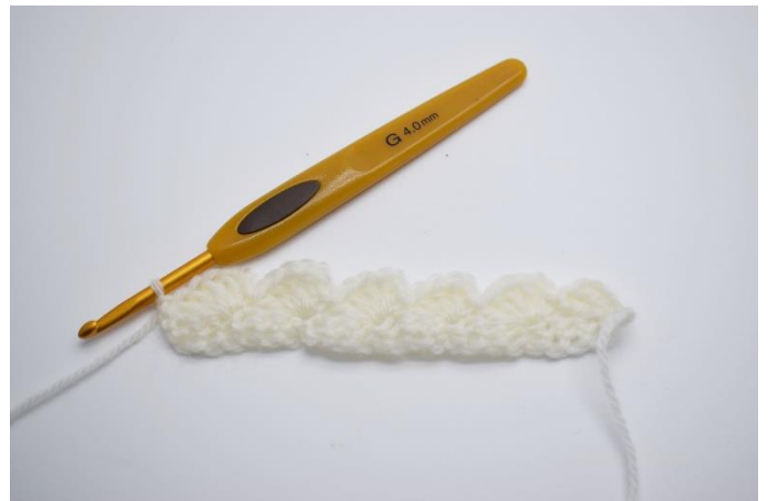
10. First row looks like this now.