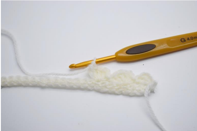
7. In next st work "1 sc, 2 ch, 4 dc".