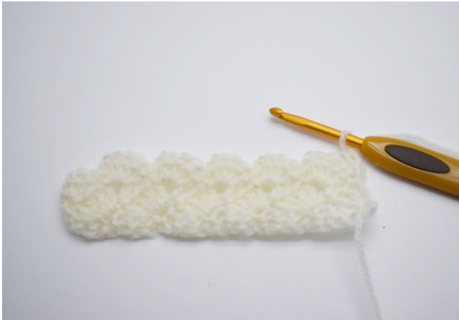
1. Turn row 83 as usual using 3 ch.